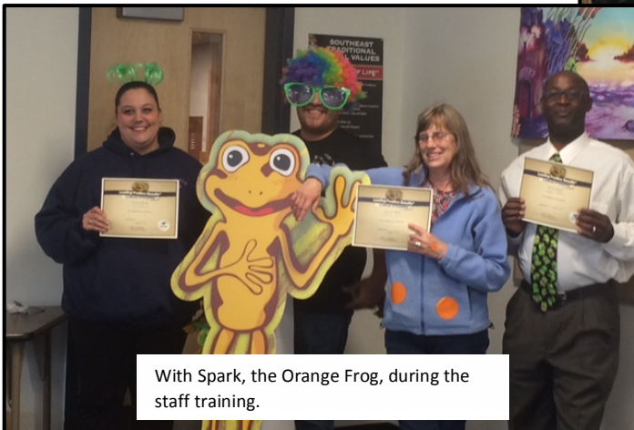
With Spark, the Orange Frog, during the staff training.