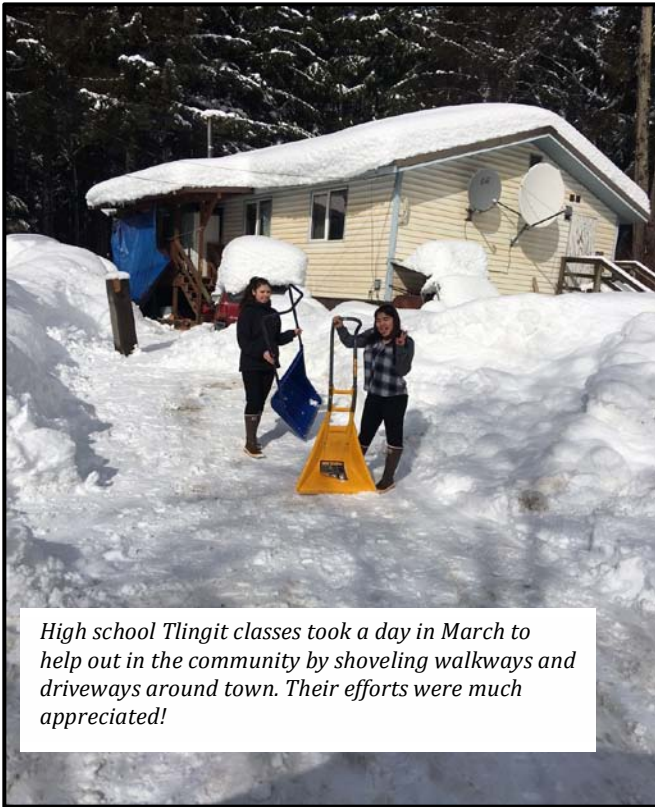
High school Tlingit classes took a day in March to help out in the community by shoveling walkways and driveways around town. Their efforts were much appreciated!