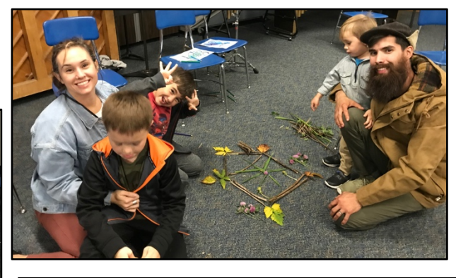
These photos were taken on the first Art Night, held September 28<sup>th</sup>.