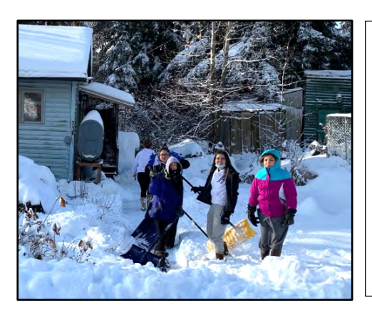
Students in Middle School Tlingit Language Class spent several days in November shoveling walkways and driveways for community elders. They shoveled at 15 homes over the course of a week.

Thank you again veterans for all you do for us! Hoonah Schools Students and Staff