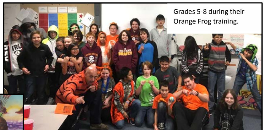
Grades 5-8 during their Orange Frog training.

Hoonah City Schools is one of two schools in the nation that has trained their students. Our kids are known across the United States for being engaged and focusing on Happiness. This spring we are coming your way, Hoonah. Watch for the high fivers on National High Five Day or just a big smile and an Orange wristband coming your way!