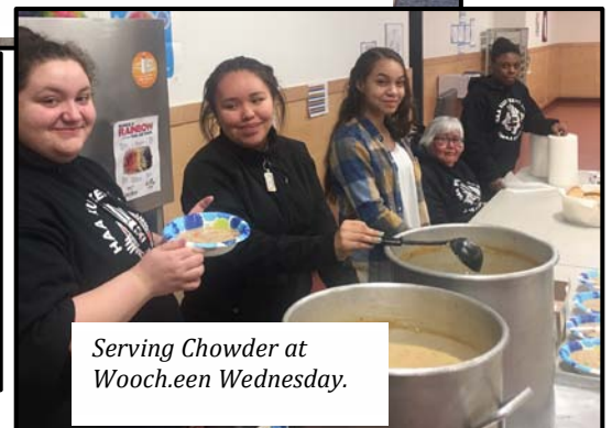
Serving Chowder at Wooch.een Wednesday.