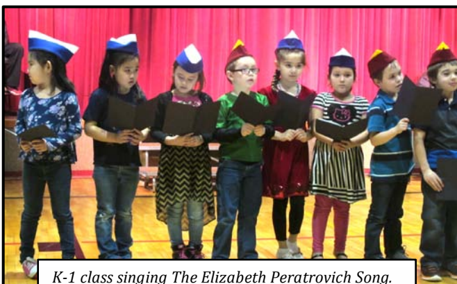
K-1 class singing The Elizabeth Peratrovich Song.

to all who helped to make it a success. And a big Kúnáx Yak'ei (Good Job!) to the students and staff for your participation.