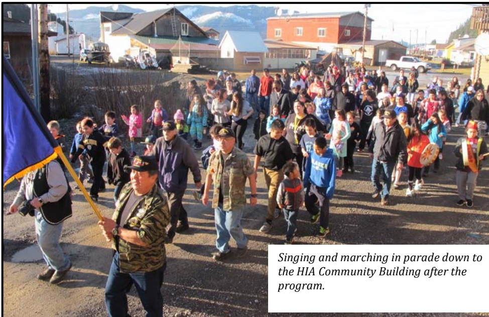
Singing and marching in parade down to the HIA Community Building after the program.

Gunalchéesh to everyone who attended this special event, and