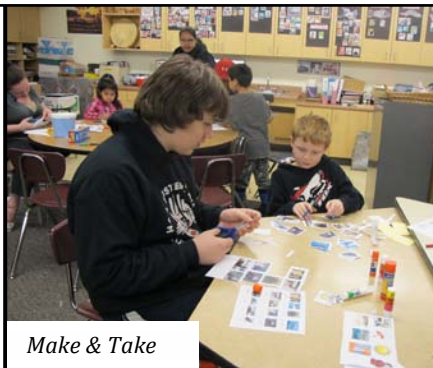
Make & Take