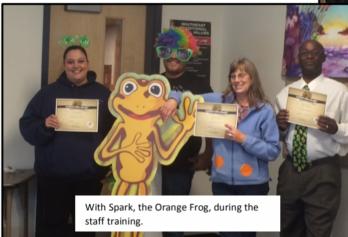
With Spark, the Orange Frog, during the staff training.