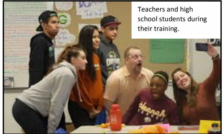
Teachers and high school students during their training.

our students. Every student, including the primary grades, has a copy. The comic title is: SPARK the ORANGE FROG: The Battle of the Thrall . Our primary students were involved in the process but not the full day training. Our most excellent trainers, Coach Gretsinger and Devin Hughes, were the Wild and Crazy Happiness teachers. The goal of the day was for each student to design a Happiness Plan.