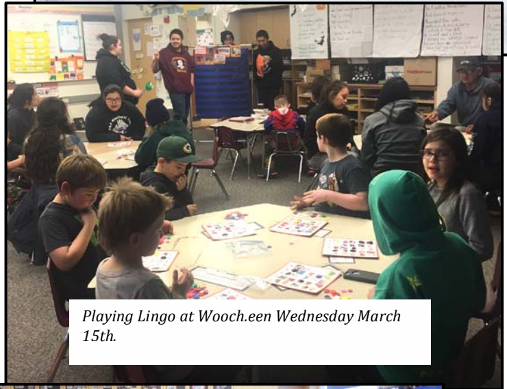
Playing Lingo at Wooch.een Wednesday March 15th.