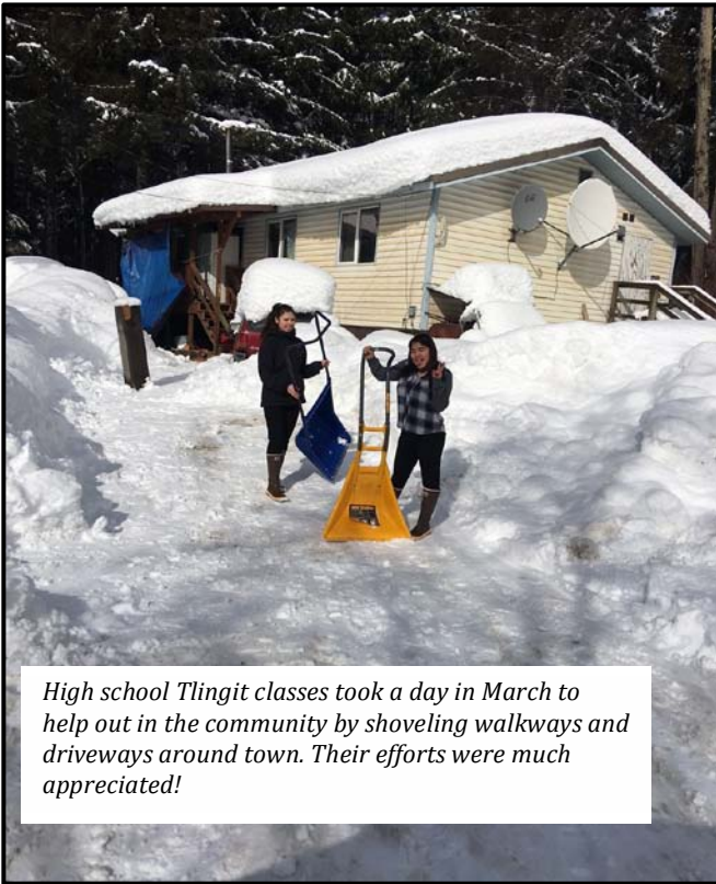
High school Tlingit classes took a day in March to help out in the community by shoveling walkways and driveways around town. Their efforts were much appreciated!