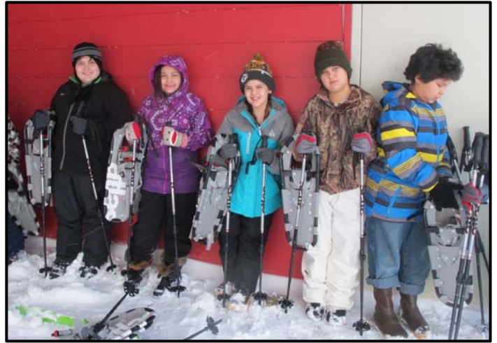
The fourth graders spent some time snowshoeing during our snowy month of March!