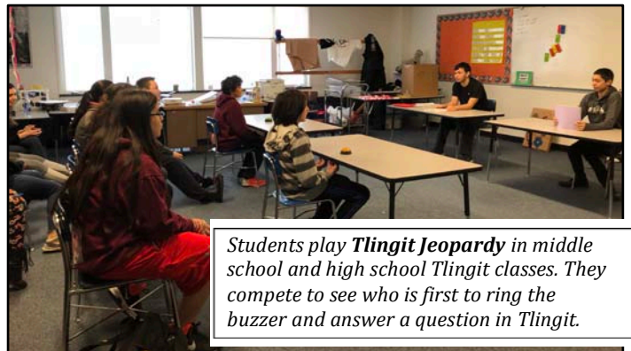
Students play Tlingit Jeopardy in middle school and high school Tlingit classes. They compete to see who is first to ring the buzzer and answer a question in Tlingit.

Aatlein Gunalchéesh for giving us your time!